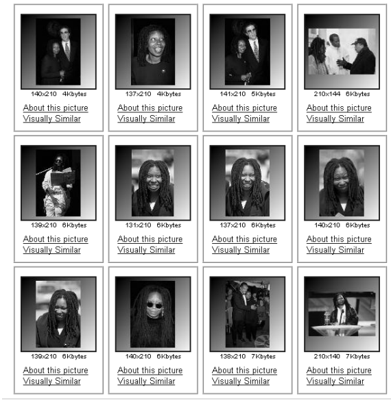
Figure 2: AltaVista Photo Finder response page.

You were looking for "Whoopi Goldberg". We found 42 picture(s). [verbose listing]