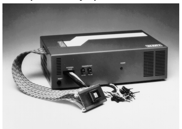
The HMI-200-8096 emulator is a high performance development system which combines the control of an in-circuit emulator with the power of a logic analyzer to provide a complete debugging environment for hardware and software.

with the HMI-200-8096! Combined with SourceGate II, HMI's acclaimed source-level debugger, the HMI-200-8096 provides the industry's most powerful debugging tool for the 8096/196. Of course, you would expect nothing less from the company that provides the best development tools in the industry. That company is HMI!