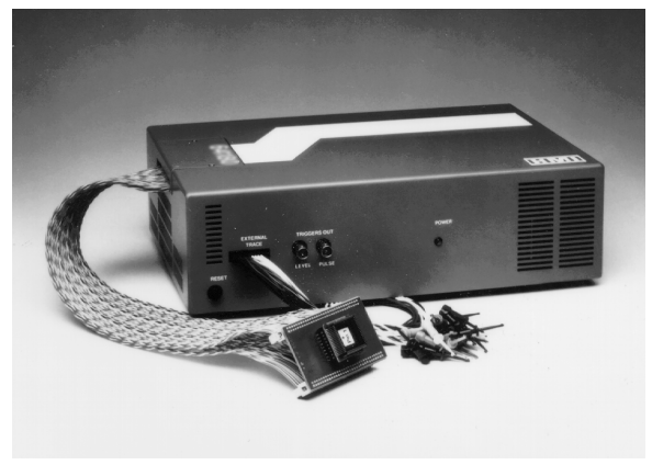
The HMI-200-Z80 emulator is a high performance development system which combines the control of an in-circuit emulator with the power of a logic analyzer to provide a complete debugging environment for hardware and software.

with the HMI-200-Z80! Combined with SourceGate II, HMI's acclaimed source-level debugger, the HMI-200-Z80 provides the industry's most powerful debugging tool for the Z80. Of course, you would expect nothing less from the company that provides the best development tools in the industry. That company is HMI!