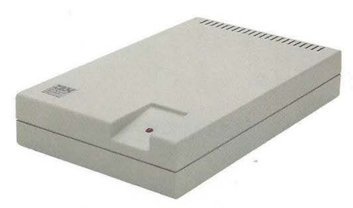
IBM 5178 PC Network Translator Unit