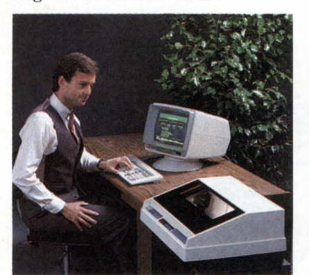
Lear Siegler's new VersaPrint™ 500 Series printers combine with Lear Siegler video display terminals for hard copy output.

Place your order today by calling your local Authorized Distributor or, for quantities in excess of 500 units, your Regional OEM Sales Office.