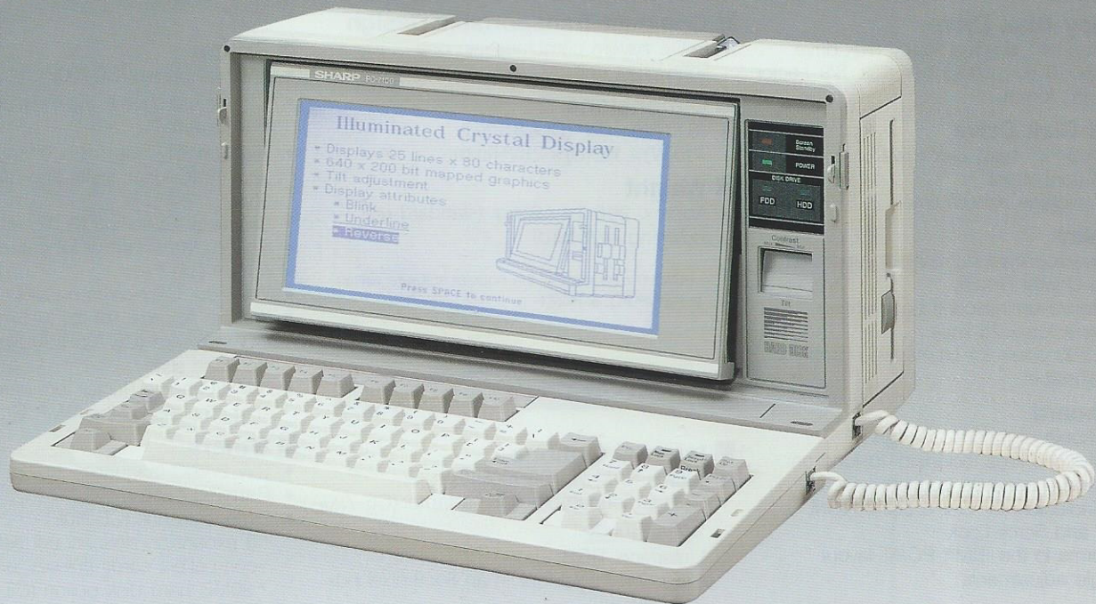
The picture represents the U.S. model.

Compact Personal Computer Featuring a Built-in 20MB Hard Disk Drive, Illuminated Supertwist Liquid Crystal Display and Extensive Software Compatibility