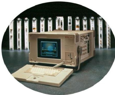
E4200B Form-7 Base Platform